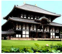
Great Buddha Hall of Todaiji